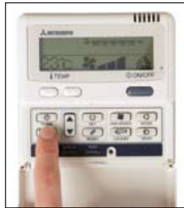
RCE1 Wired Controller