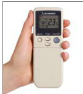
Optional 'Wireless' Controller

Energy Saving up to 38% with INVERTER Technology